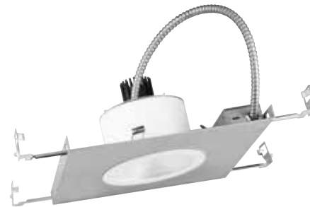
Typical C Class Round with New Construction Frame